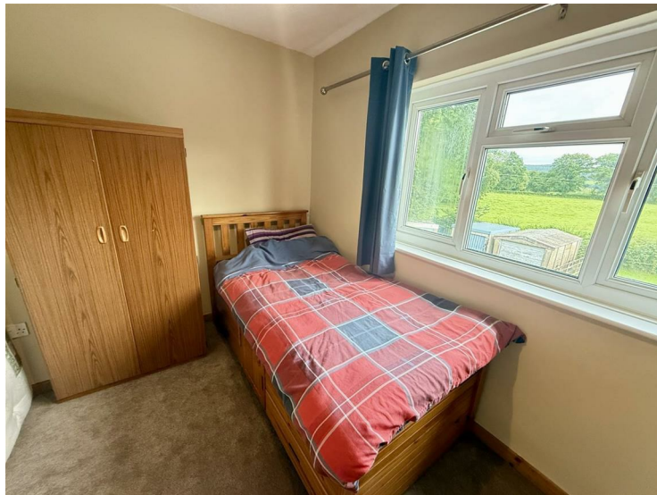
Radiator, rear window with attractive views over open fields