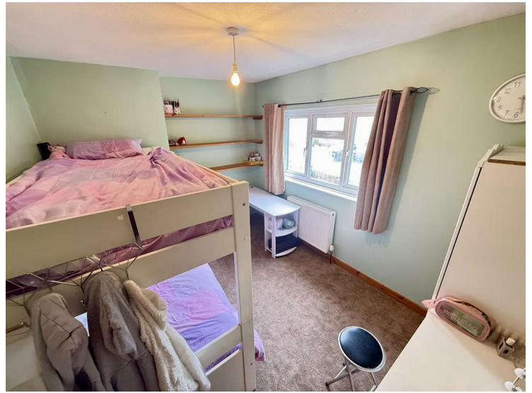
Radiator, front window