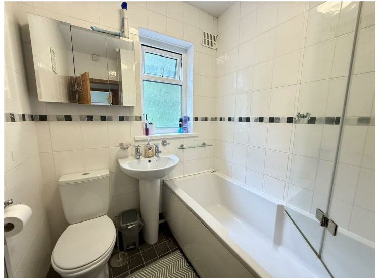
Having bath with shower unit over having tiled surround, toilet, wash hand basin, extractor fan, heated towel rail.