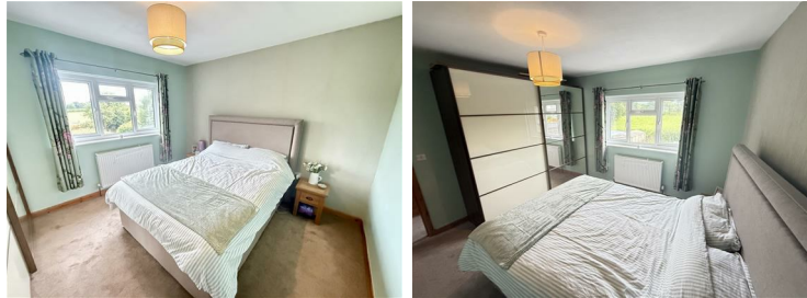
Built-in wardrobe with sliding mirror front doors, radiator, rear window with attractive views over open fields